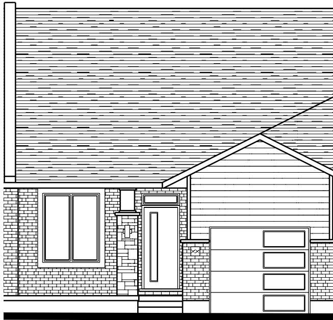
ARBOR (ESSENTIAL SPECS) LOT 42C (#10) FINCH STREET FRONT ELEVATION 9' MAIN FLOOR CEILING APPROX. 1,132 TOTAL SQ. FT.

This plan is the property of Hayslee Homes and any reproduction of this plan, its concepts or ideas, is strictly prohibited. Plans and specifications are approximate and are subject to change without notice. Finished area and room dimensions will change depending on front elevation selection. E.A.O.E. 2025