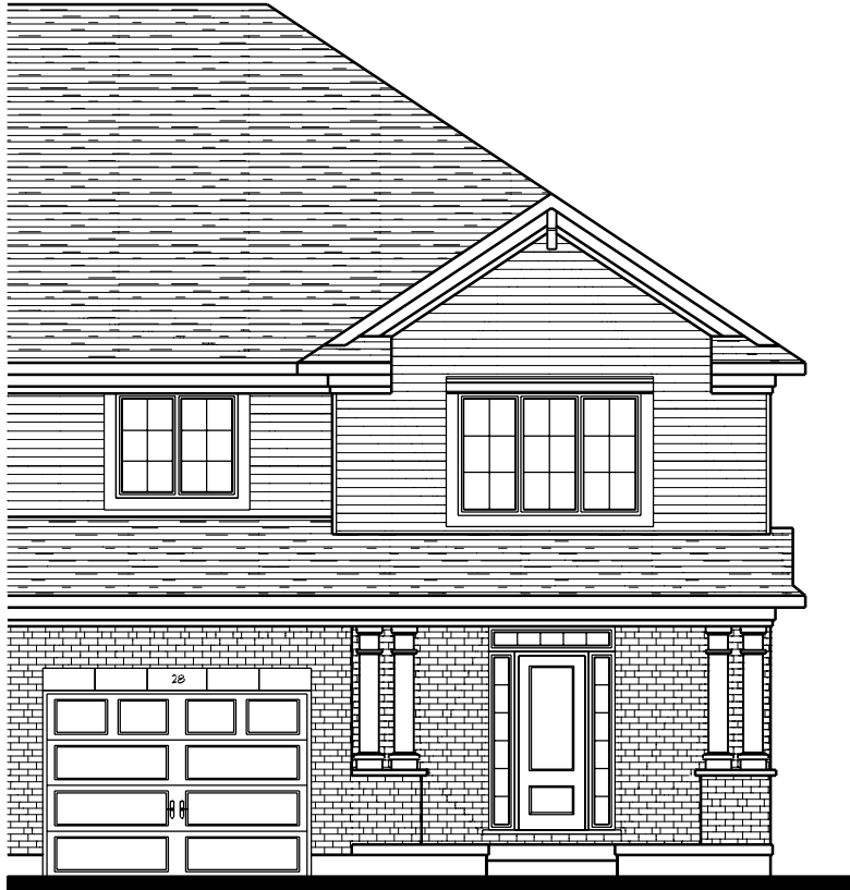
RIDGEMILL (ESSENTIAL SPECS) LOT 40B (*28) HEMLOCK CRESCENT FRONT ELEVATION 9' MAIN FLOOR CEILING APPROX. 1,921 SQ. FT.

This plan is the property of Wayhome Homes and any reproduction of this plan, its concepts or ideas, is strictly prohibited. Plans and specifications are approximate and are subject to change without notice. Finished area and room dimensions will change depending on front elevation selection. EAO.E. 2024