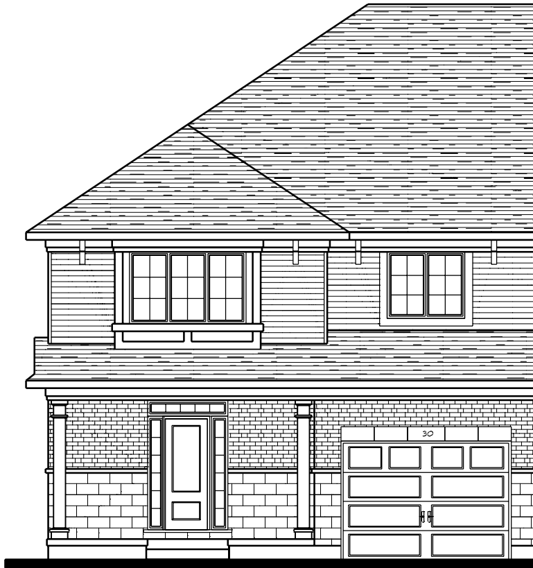
RIDGEMILL (PREMIUM SPEC6) LOT 39A (*30) HEMLOCK CRESCENT FRONT ELEVATION 9' MAIN FLOOR CEILING APPROX. 2,351 SQ. FT.

This plan is the property of Hayhoe Homes and any reproduction of this plan, its concepts or ideas, is strictly prohibited. Plans and specifications are approximate and are subject to change without notice. Finished areas and room dimensions will change depending on front elevation selection. E.A.O.B. 2024 CREATED JUN. 2024